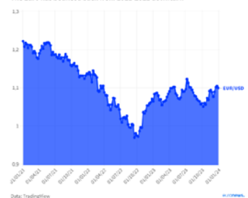
The Euro has bounced back from 2021-2022 downturn

emphasised the need to remain vigilant, arguing that now is not the time to "lower our guard" on interest rates.